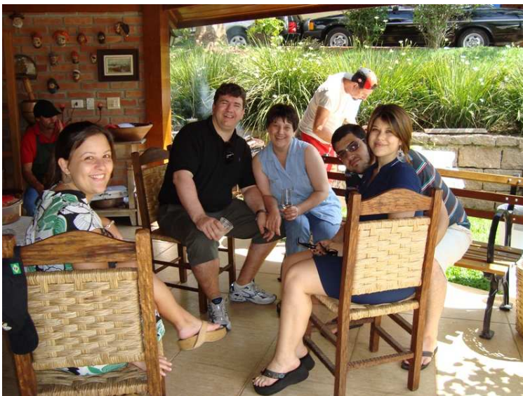
Another BBQ with all of my new colleagues from the controlling department at the Campinas 2 plant.